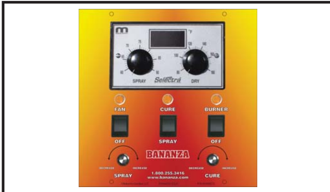
Digital Dual #1 Remote