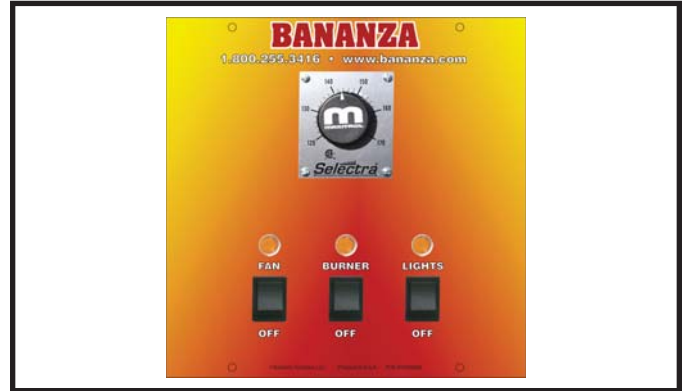
Basic II (Cure) Remote