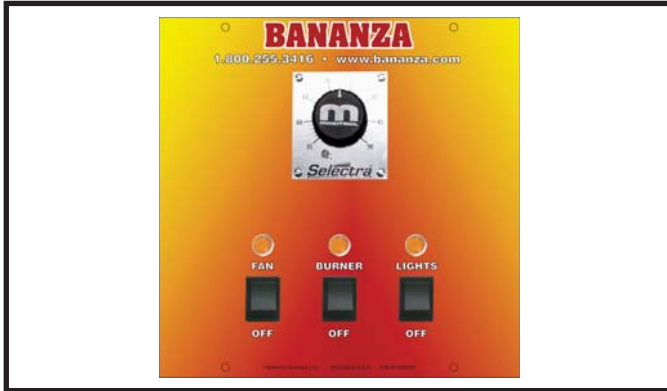
Basic II (Spray) Remote