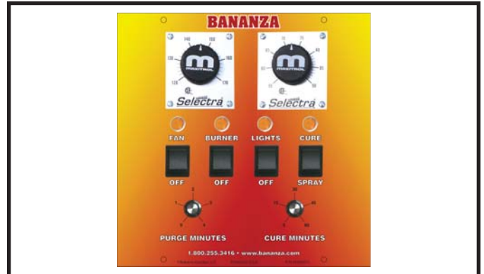
Dual #2 Remote