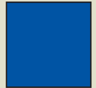
3T5 - Blue