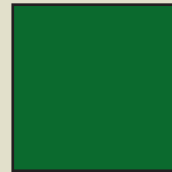
333 - Green

Warning: Transparent vinyl welding curtains provide protection for the casual viewer or passerby. Not intended as a substitute for normal eye protection for close or long-term viewing. The user must wear protective eyewear suitable for the application