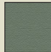
301 - Olive Drab