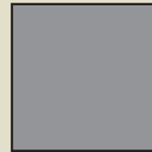
332 - Gray