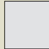
339 - Clear