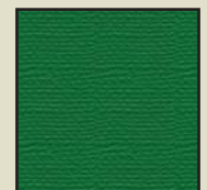
33X - Green