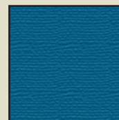
335 - Blue